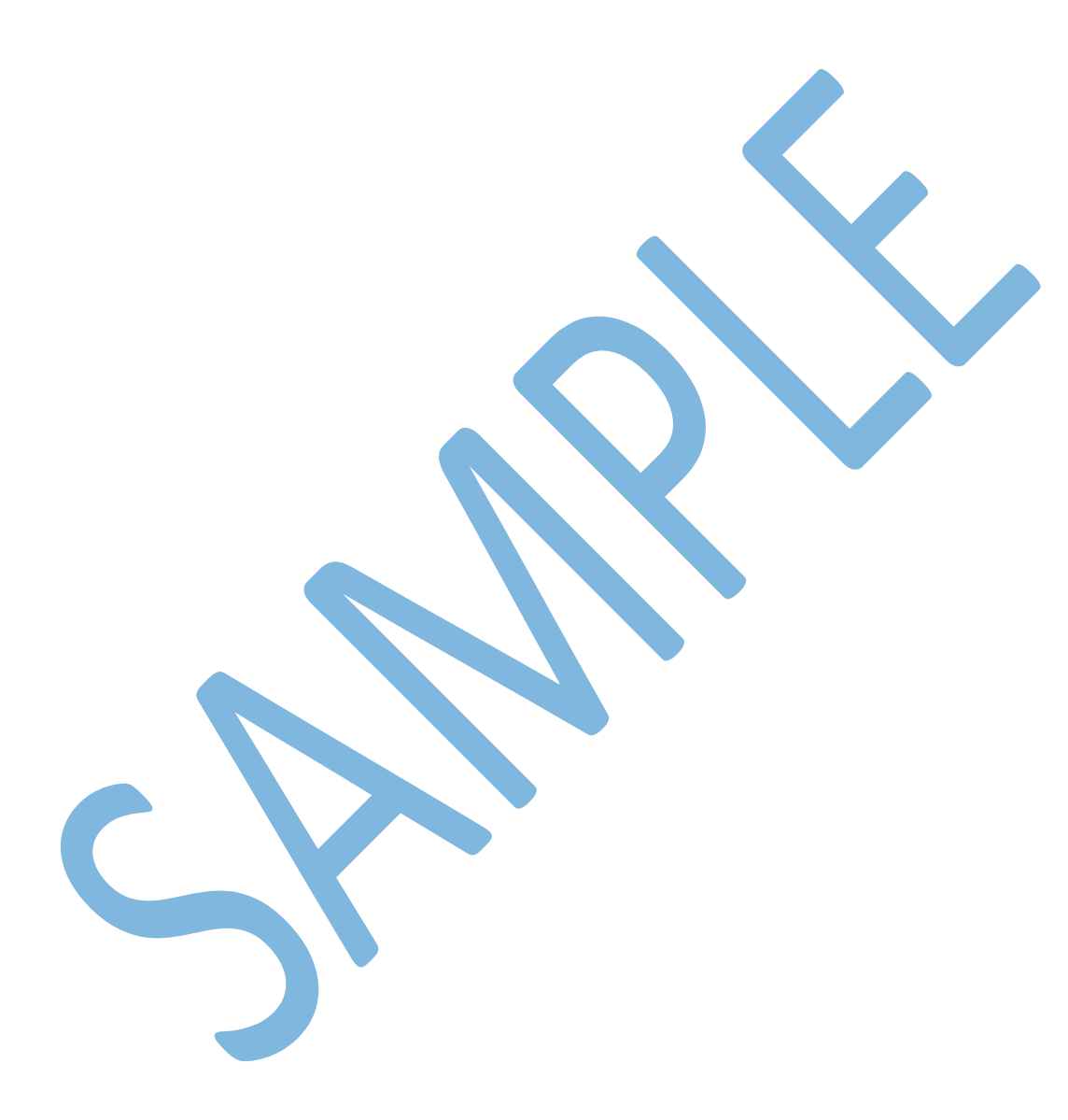
EXHIBIT "A" <u>LEGAL DESCRIPTION AND MAP DEPICTING LOCATION</u>